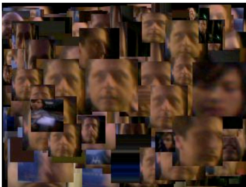
Fig 2. A still taken from a video recording of 'I See You' in action.

The live video feed from the camera is constantly scanned by the Max/MSP/Jitter patch for patterns that appear to be human faces. If a face is found then it is grabbed from the video feed and added to the video screen in a random location and size. Over time the video screen begins to display a collage of viewers' faces - with the most recent viewers appearing on the 'top'. This is illustrated in Figure 2.